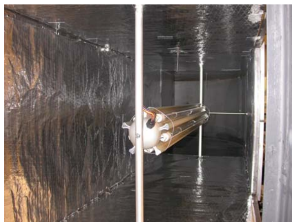
Figure 2-2. Device installed inside the test rig. There are 5 lamps. A reflective surface was placed in the duct.