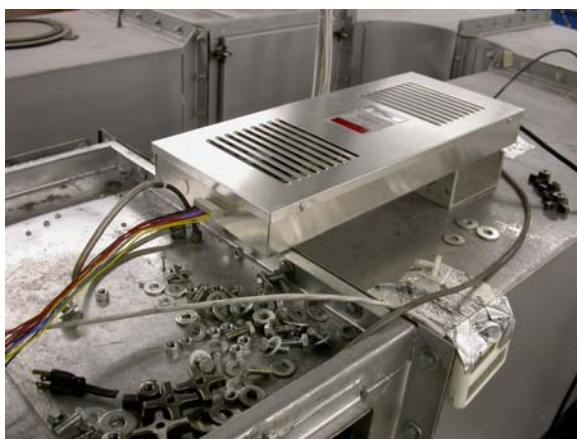
Figure 2-1. Ballast box installed on the outside of the test rig.

Table 2-1 provides information on the system as supplied by the vendor. Figures 2-1 and 2-2 provide views of the device as tested, installed in accordance with the manufacturer’s specifications.